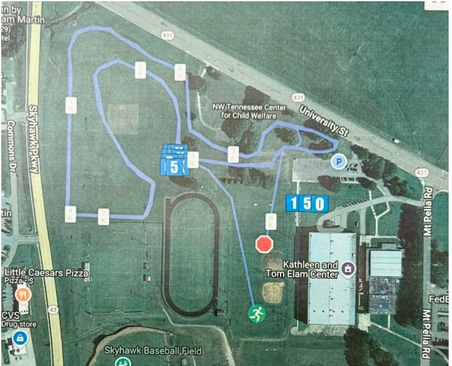
Men's 8K Loop